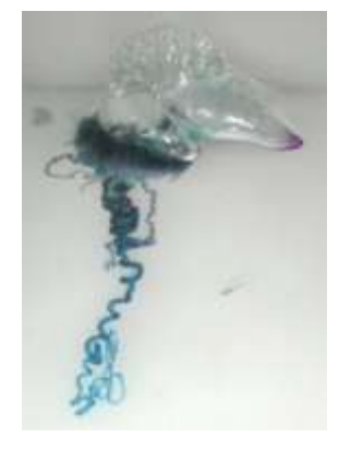
Portuguese Man o'War /